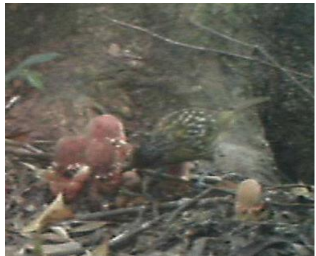
Figure 7. A Macleay's Honeyeater feeding from Balanophora fungosa flowers.

were clearly nervous, looking upwards between each of the brief feeding probes.