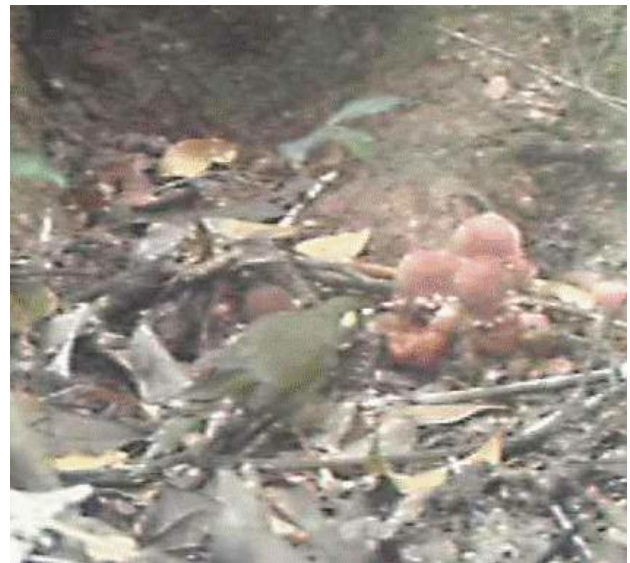
Figure 6. A probable Graceful Honeyeater feeding at Balanophora fungosa flowers.