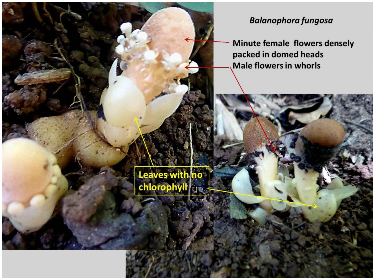
Figure 1. Balanophora fungosa on Bicton Hill near Mission Beach on 2 August 2016.

Ultra-high close-ups can be viewed at: http://botany.org/Parasitic_Plants/Balanophora_fungosa.php