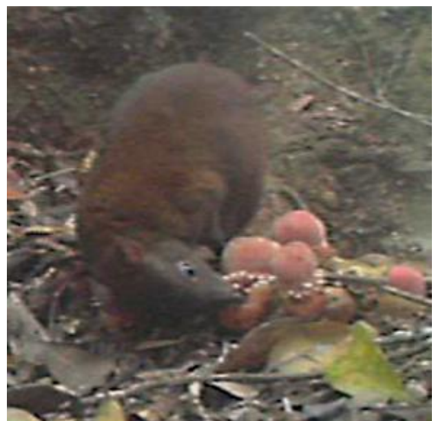
Figure 4. A Musky Rat Kangaroo in typical feeding pose at male flowers of Balanophora fungosa at Speewah.

Rats ( Rattus sp.) were the most common vertebrate visitors to Balanophora and all visits were at night, from just after dark (earliest 19:17 h) to dawn (latest 06:05 h). Some of those