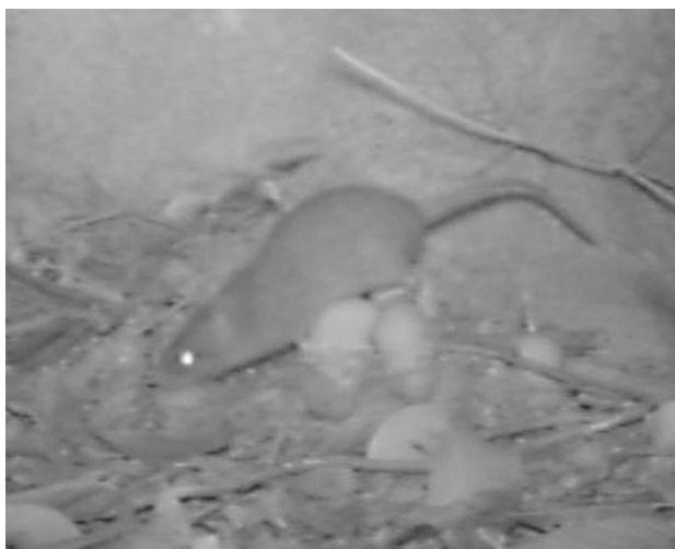
Figure 5. Rat ( Rattus sp.) at Balanophora fungosa flowers at Speewah.

Most honeyeater feeding events were of Graceful Honeyeaters (estimated 7–9 feeds, this imprecision being due to identification difficulties with Yellow-spotted Honeyeater). All foraging encounters by honeyeater species involved the individuals standing on the ground or on fallen branches immediately adjacent to the plant, or less frequently on the plant itself, and feeding from male flowers (Figs. 6, 7). Visits occurred throughout the day between 07:07 and 17:46 and lasted from a few seconds up to the full 30 s video length. All birds, and particularly the Graceful Honeyeaters,