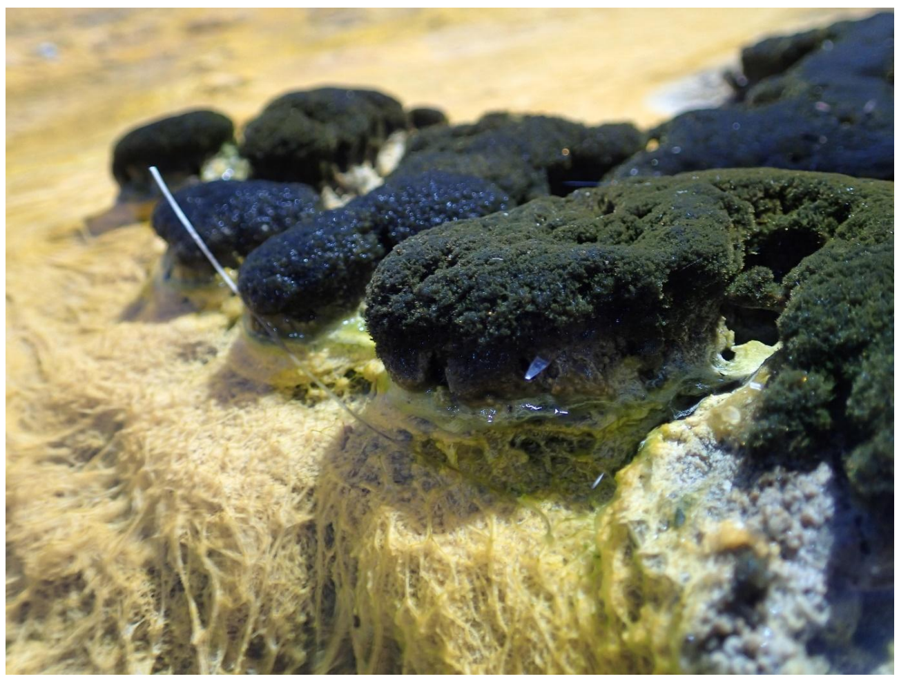
Figure 3. Stromatolite-forming cyanobacteria Ewamiania thermalis at Talaroo hot springs superficially looks similar to a freshwater sponge.

area was voluntarily made a nature reserve and was used as a tourist park with camping facilities in close proximity. Since 2012 the broader Talaroo property has been destocked of cattle and is now managed by the Ewamian Aboriginal Corporation. Talaroo is now formally declared as a Nature Refuge under the Nature Conservation Act 1992 and is an Indigenous Protected Area to be managed for the protection of natural and cultural values in accordance with the guidelines of the International Union for the Conservation of Nature (Ewamian Aboriginal Corporation 2017).