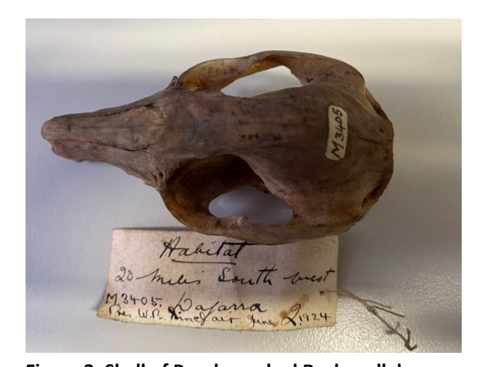
Figure 2. Skull of Purple-necked Rock-wallaby (holotype) collected by W.B. Sinclair in June 1924. M.3405, Australian Museum (Sydney). [Note: "2" in the bottom right of the label is a museum notation, not part of the date].

The PNRW specimens are held at the AM (seven, including the holotype), at QM (three) and two specimens (a skull and a skin) at the Natural History