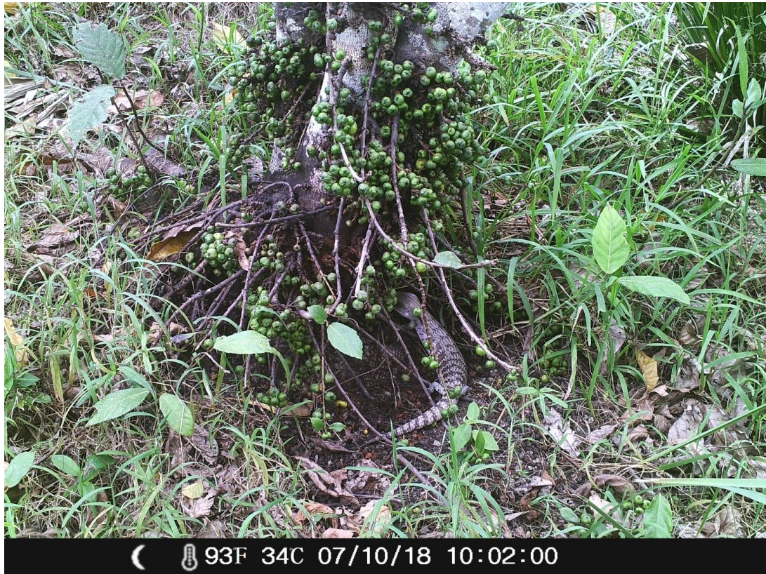
Figure 2. An Eastern Blue-tongued Skink, T. s. scincoides (#2) consuming a fruit attached to a raceme sprouting from the base of the Red Leaf Fig Tree, Ficus congesta .