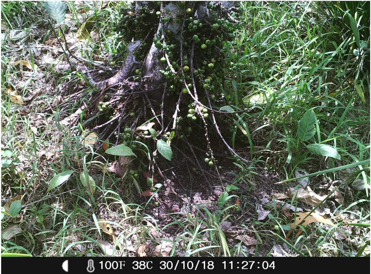
Figure 4. An Eastern Blue-tongued Skink, T. s. scincoides (#4) climbs part way up the base of the main stem to consume a large green fruit from the Red Leaf Fig Tree, Ficus congesta .