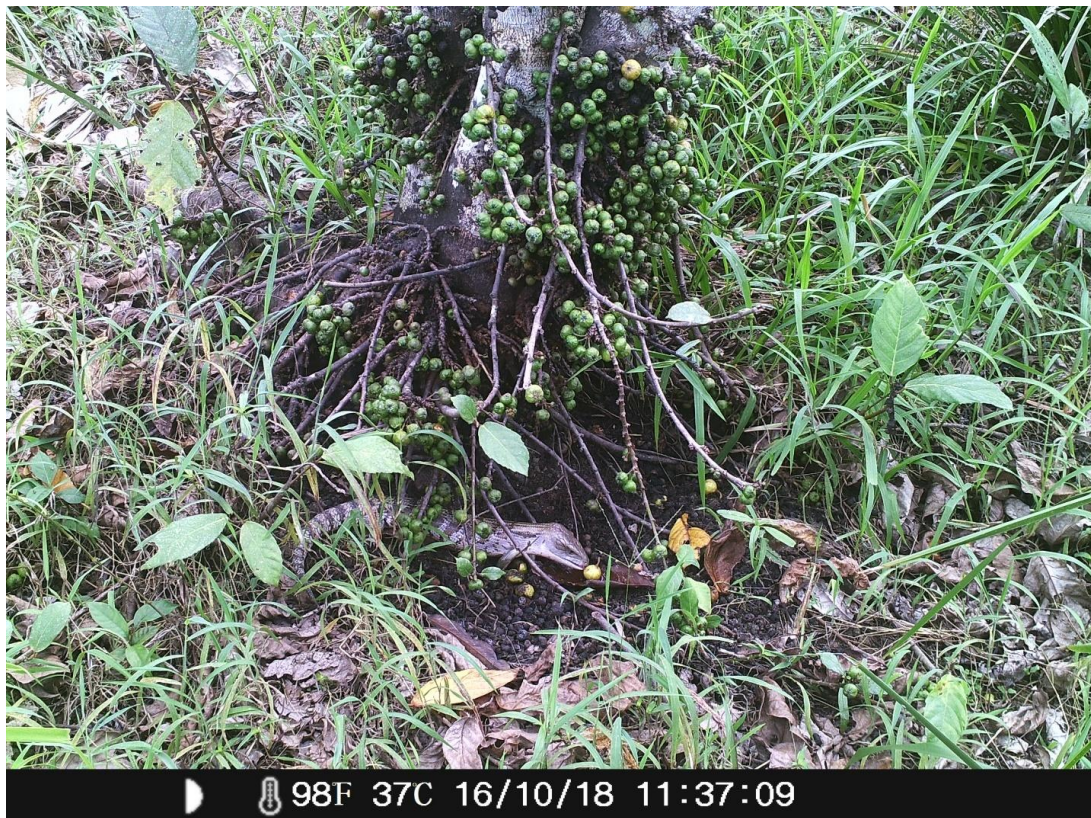
Figure 3. An Eastern Blue-tongued Skink, T. s. scincoides (#2) consuming a ripe (yellow) fruit that had recently fallen from the Red Leaf Fig Tree, Ficus congesta .