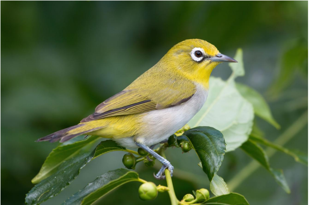
Figure 2. Ashy-bellied White-eye ( Zosterops citrinella ), Green Island.