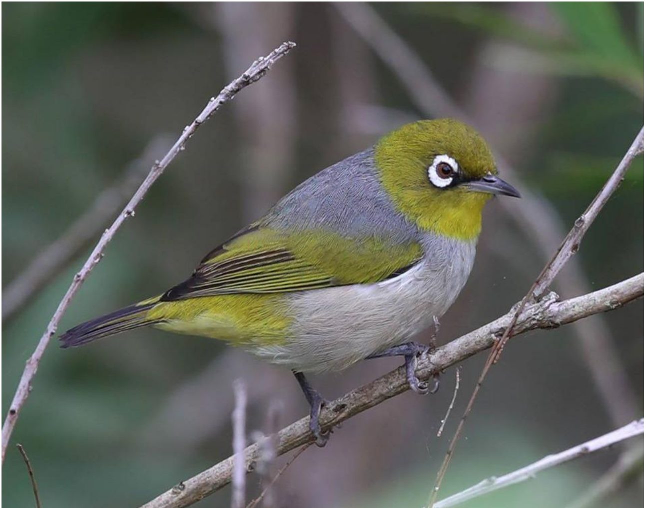
Figure 4. Northern subspecies of Silvereye ( Zosterops lateralis vegetus ), Lake Tinaroo, northeast Queensland.

Island but again was uncommon. Because Little Woody visits were always in early January, at the commencement of the Wet Season and before the breeding season, fresh juveniles were never encountered. On the contrary, my visit to Green Island was at the end of the Wet Season when there were many fledglings and juveniles present. I suspect these juveniles and immatures may have been the cause of the ongoing confusion and may have given rise to the suggestion of hybridisation.