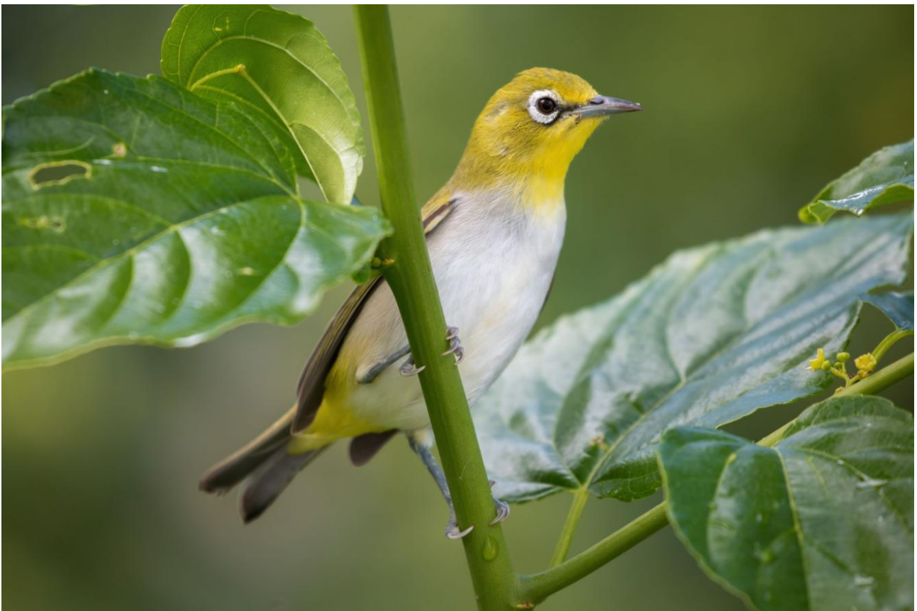
Figure 3. Ashy-bellied White-eye ( Zosterops citrinella ), Green Island.