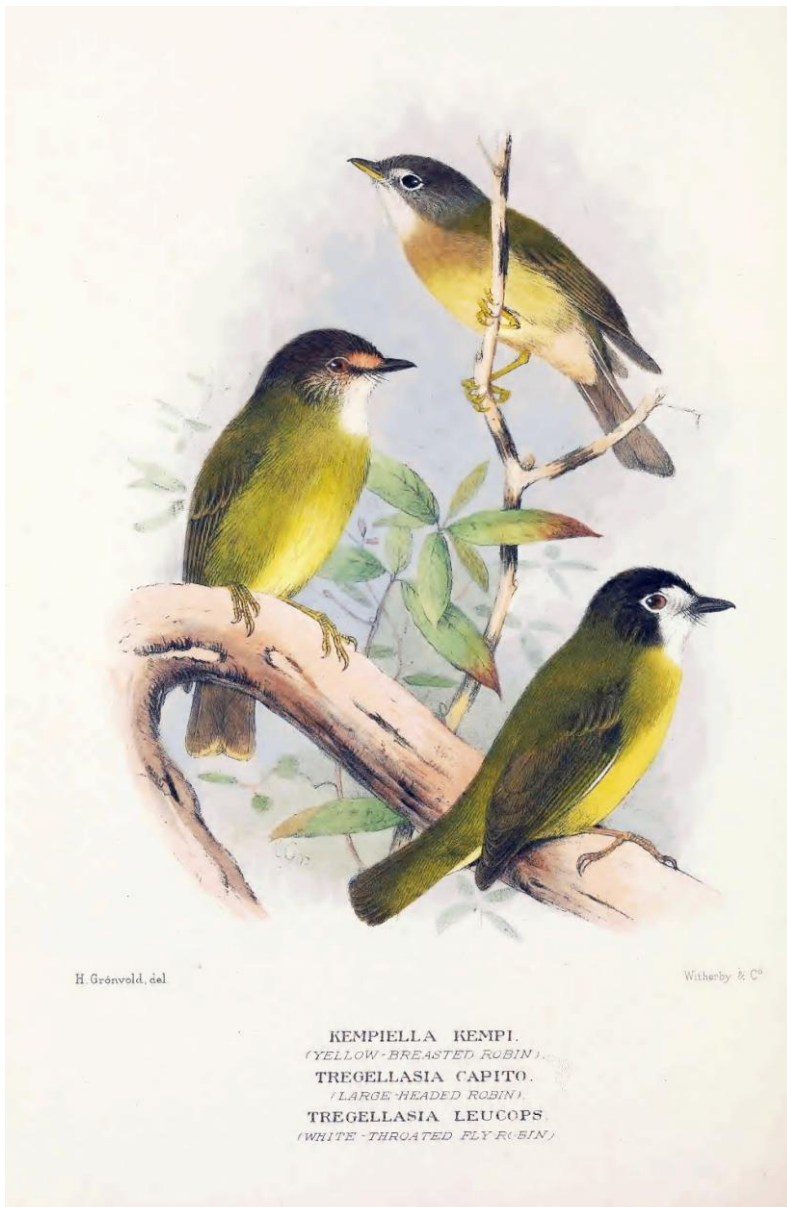
Figure 1. H. Grönvold's lithograph of the Yellow-legged Flycatcher Kempiella griseiceps (upper), Pale-yellow Robin Tregellasia capito (centre) and White-faced Robin T. leucops (lower): Mathews (1920).

specimen as a subspecies, K. g. kempii (Mathews 1927: see Methods for names used here). Accurate illustrations are an important aid for observers to distinguish between similar species and identify birds. The first large colour plate of YLF was by H. Grönvold (Mathews 1920, Fig. 1). The earliest field guide to include YLF (Leach 1926) gave no illustration, but noted the yellow feet and bi-coloured bill. The first field guide illustration was small, and did not show the legs (Cayley 1931, 1958). Further large illustrations were published by Mack (1953) and Officer (1969); the first large illustration in a field guide was by Slater (1973). Photographs of YLF (albeit limited) only became readily available in 1988 (Boles 1988).