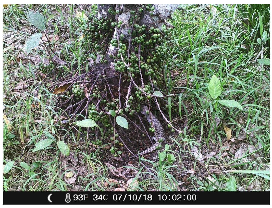
Figure 2. An Eastern Blue-tongued Skink, T. s. scincoides (#2) consuming a fruit attached to a raceme sprouting from the base of the Red Leaf Fig Tree, Ficus congesta .