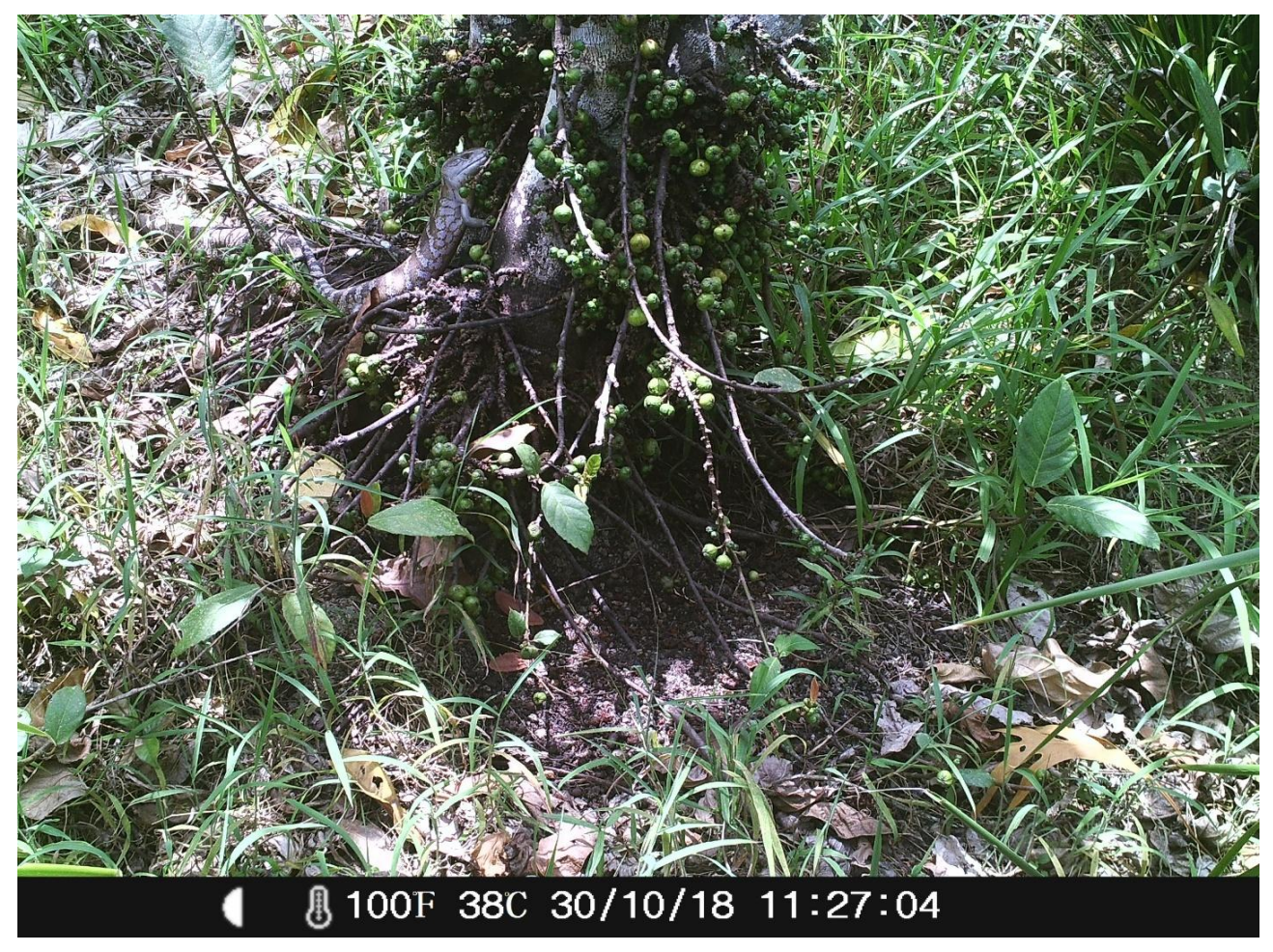
Figure 4. An Eastern Blue-tongued Skink, T. s. scincoides (#4) climbs part way up the base of the main stem to consume a large green fruit from the Red Leaf Fig Tree, Ficus congesta .