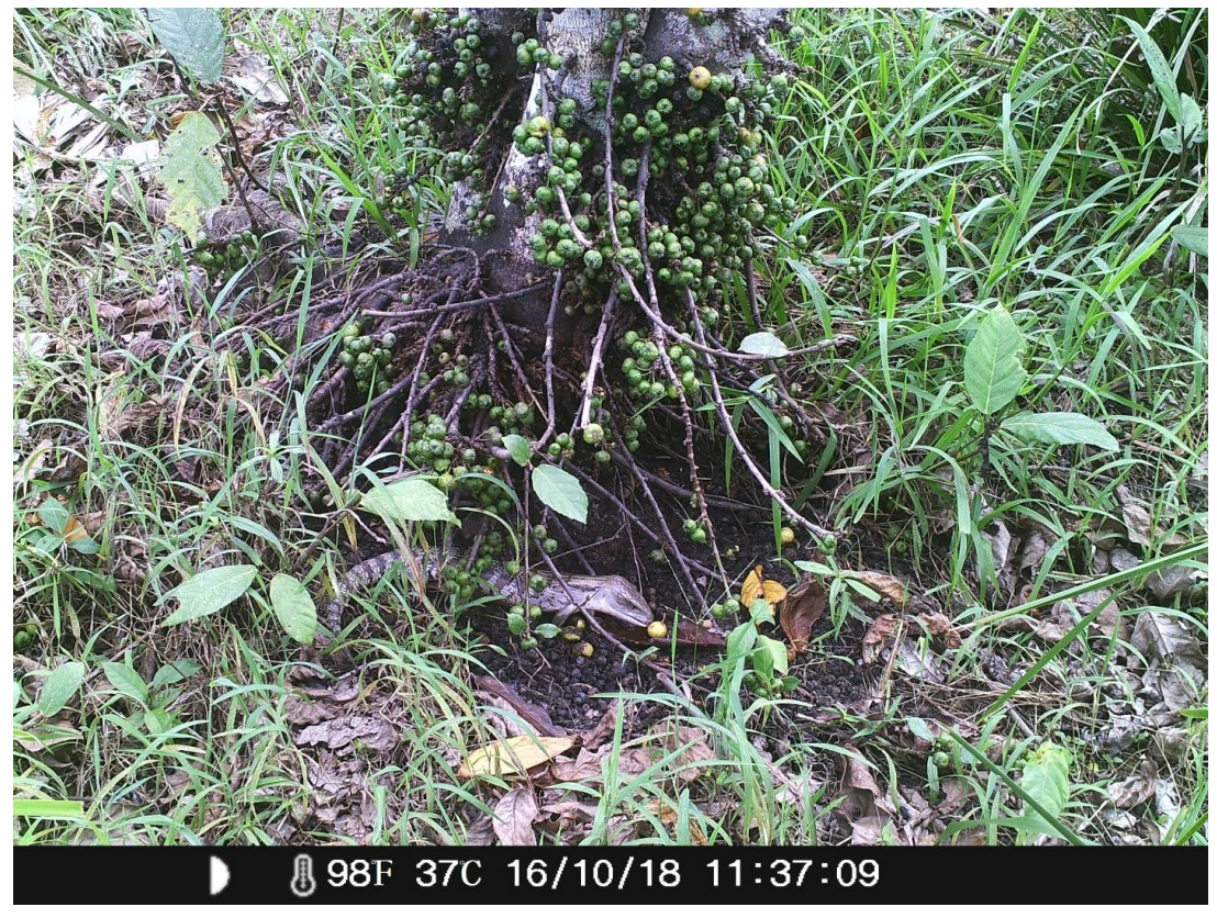
Figure 3. An Eastern Blue-tongued Skink, T. s. scincoides (#2) consuming a ripe (yellow) fruit that had recently fallen from the Red Leaf Fig Tree, Ficus congesta .